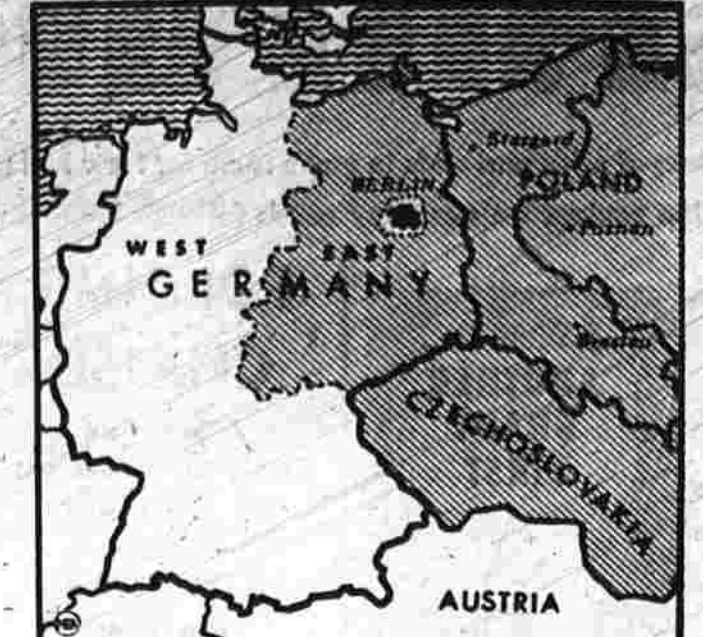
An island surrounded by the creeping drabness of a typical Red collective society.